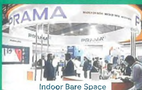
Indoor Bare Space