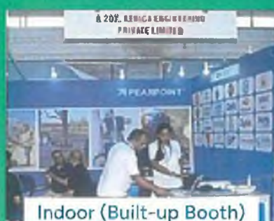
Indoor (Built-up Booth)