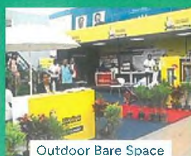
Outdoor Bare Space